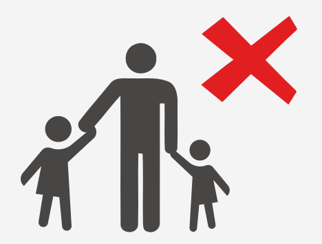
1 adult with 1 child under 4 years and 1 child aged 4 - 7 years