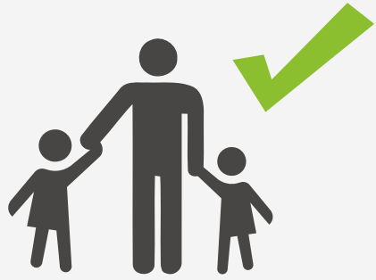
1 adult with 2 children aged 4 - 7 years