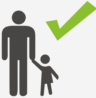
1 adult with 1 child aged under 4 years