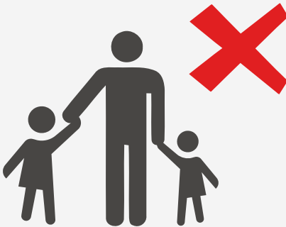
1 adult with 1 child under 4 years and 1 child aged 4 - 7 years